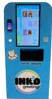
Greeting Card Kiosk*