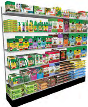
Xpress Hardware Sets