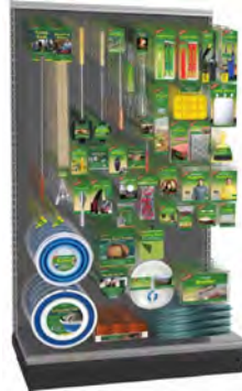
Coghlan's Camping Sets