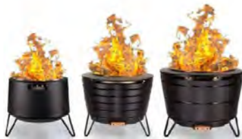
Firepits & Roasters