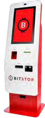
Financial Services Kiosks