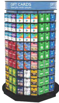
Blackhawk Gift Cards